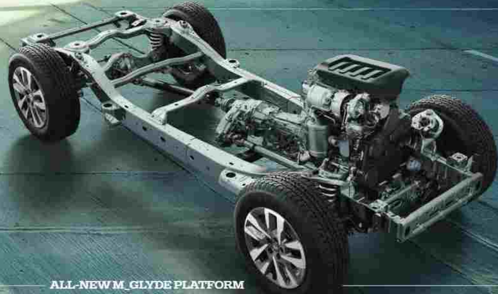
ALL-NEW M_GLYDE PLATFORM

The foundation of THE SUV is its revolutionary M_GLYDE PLATFORM chassis made with high-strength steel. Solid as a rock, high on torsional stiffness and light on weight, the chassis sets a new benchmark for comfort and strength. With the highest wheelbase in the segment*, you can expect unparalleled stability and ultimate comfort. It doesn't just marry dynamics and handling seamlessly but is the reason the Thar Roxx will forever be known as THE SUV.