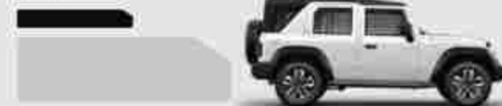
Everest White Black