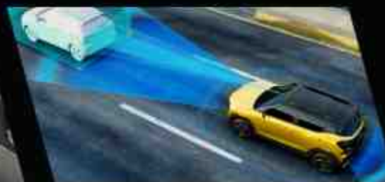
Auto Emergency Braking (Vehicles)