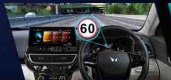
Traffic Sign Recognition