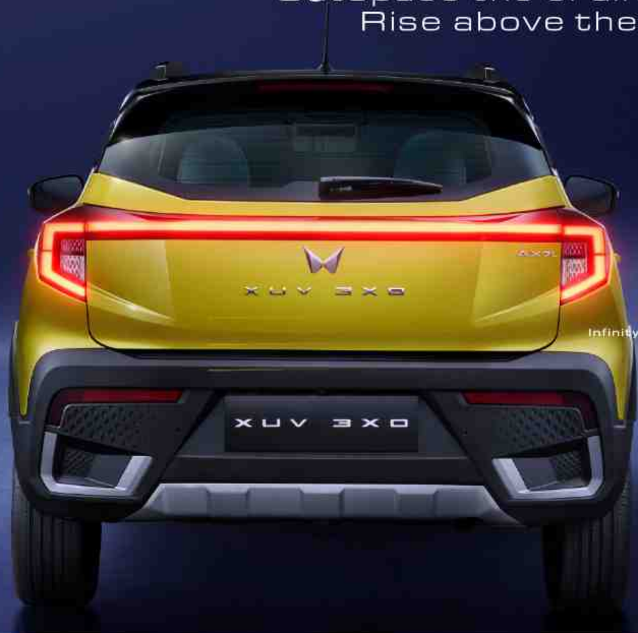
Infinity LED Tail Lamp

Outspace the ordinary. Rise above the rest.