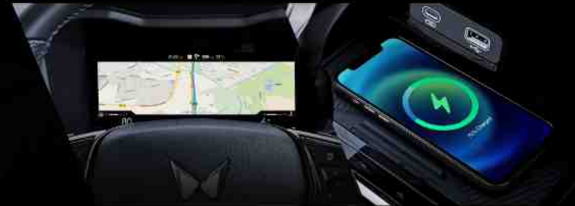
Navigation on Cluster

Tech-Driven brilliance. Engineered to impress.