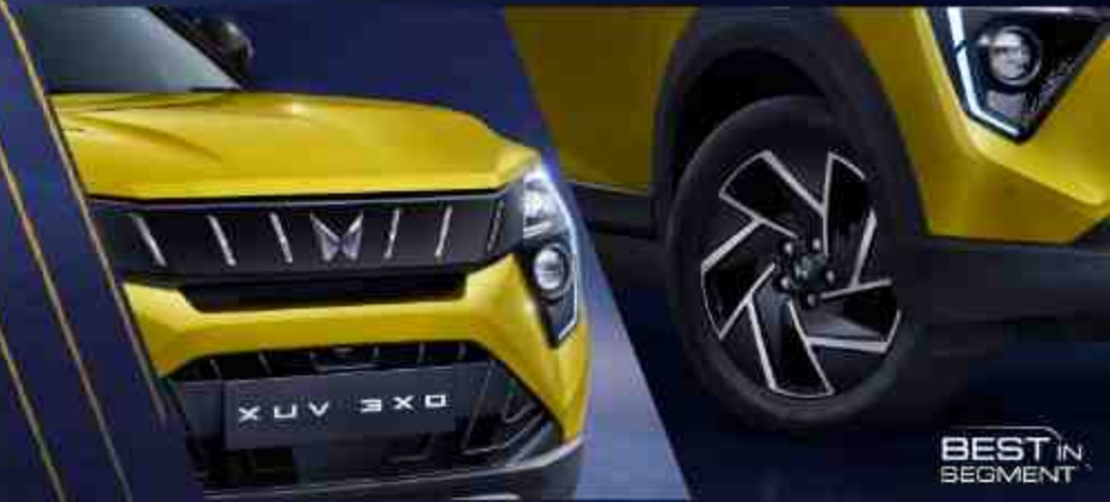
Front Grille with Piano Black Finish