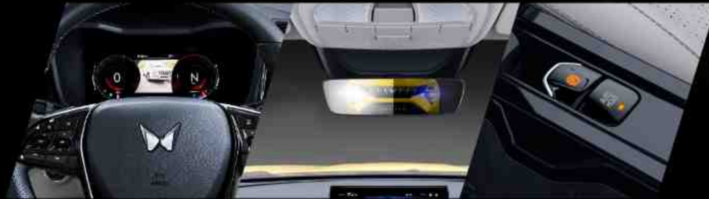
Blind Spot Monitor