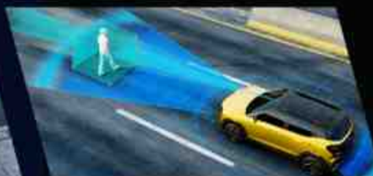
Auto Emergency Braking (Pedestrian)