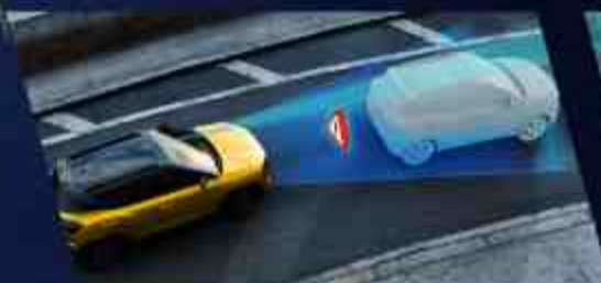
Forward Collision Warning