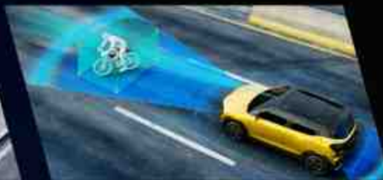
Auto Emergency Braking (Cyclist)